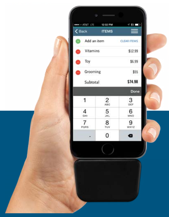
Free Authorize.Net mPOS mobile application for Apple iOS and Android devices.

Choose from dozens of turnkey, third party payment solutions, including shopping carts, online store builders, POS systems, kiosks and mobile devices. Simply visit our online Certified Solutions Directory.